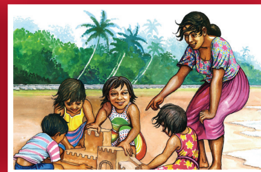
A Day to Remember

You can help children learn how they can trust God's promises and know His love for them.