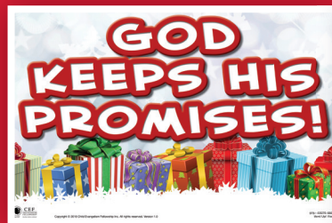
God Keeps His Promises

Celebrate Christmas by telling boys and girls the greatest story ever told using one of these Christmas Party Kits.