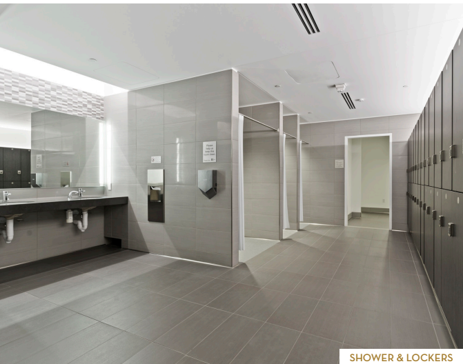
SHOWER & LOCKERS