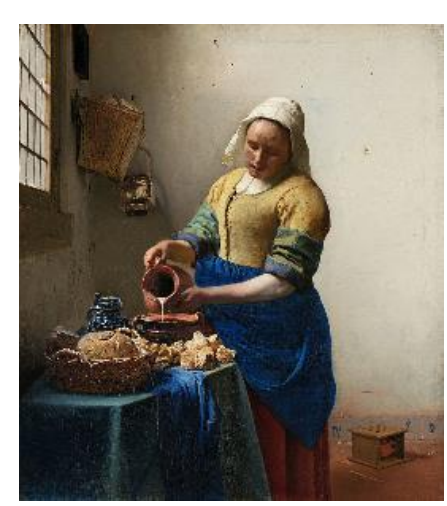
Johannes Vermeer, The Milkmaid (c. 1658)