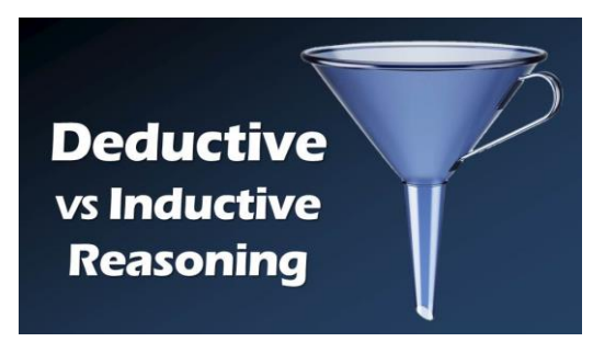
CLICK TO REVIEW ON YOUTUBE