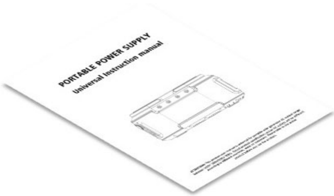
1 x User Manual