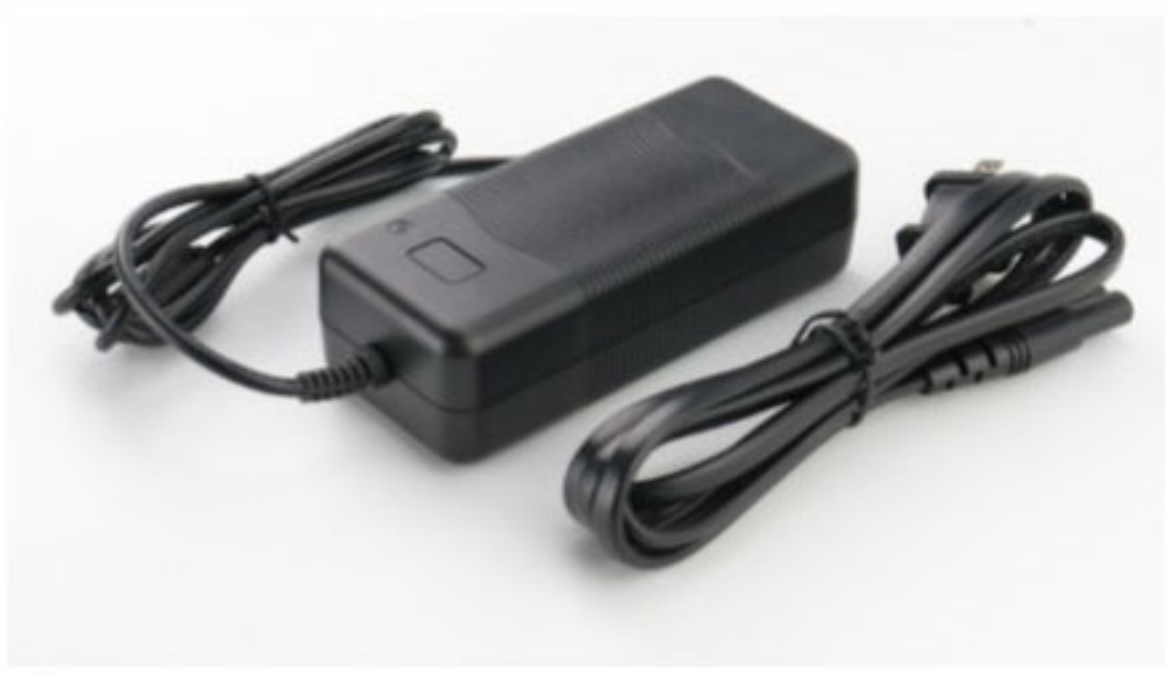
1 x 15V/3A Power Adapter