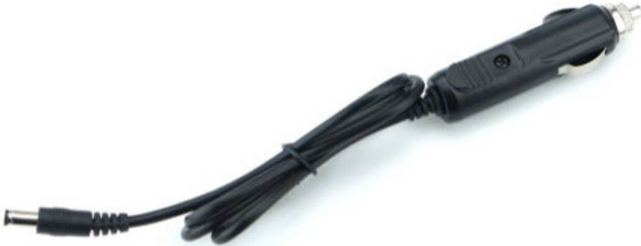
1 x car charger