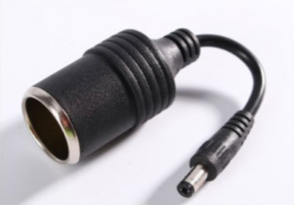
1 x cigarette light adapter