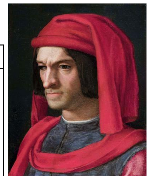
Lorenzo de' Medici