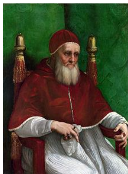
Pope Julius II