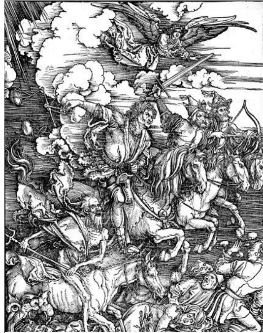
The Horsemen of the Apocalypse , depicted in a woodcut by Albrecht Dürer (ca. 1497–98)

5 And when he had opened the third seal, I heard the third beast say, Come and see. And I beheld, and lo a black horse; and he that sat on him had a pair of balances in his hand.